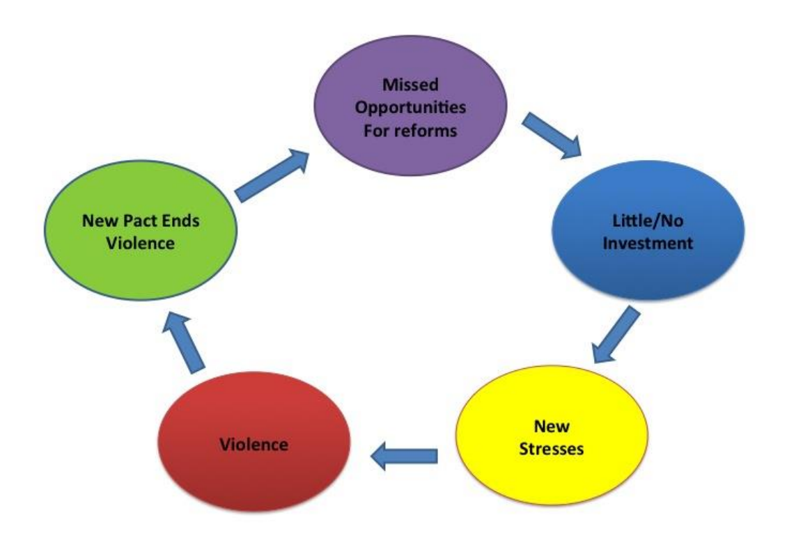
Figure Two: Fragility Trap as Conceptualized by the World Bank

The first phase ( brown circle ) is when a country out of conflict (or newly independent country, such as South Sudan) misses an opportunity to reform institutions of resistance to those of a nation-state. It would be recalled that the SPLM had issued in August 2004 its blueprint known as the <u>SPLM Strategic Framework</u> for War-to-Peace Transition, which was calling for a comprehensive reform. President Kiir (then Cdr.) was in-charge of the transformation of the Sudan People's Liberation Army (SPLA) from a guerrilla army into a professional army of a state. Vice President Igga (then Cdr.) was responsible for the transformation of the SPLM into a political party ready to govern in a multi-party democracy environment. While Dr. Machar (then Cdr.) was given the task of transforming the Civil Authority of New Sudan (CANS) into a robust civil service of Southern Sudan and eventually of an independent South Sudan.